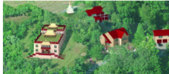
Aerial view of Deer Park showing, from left to right: the proposed new temple, the stupa, the original pavilion, the residential annex and the main house.

Deer Park's existing small temple was built in 1981 as a temporary open-air pavilion for the first Kalachakra initiation ever to be offered by his Holiness the Dalai Lama in the West. The pavilion was later enclosed to serve as a temple with seating capacity for 70 people.