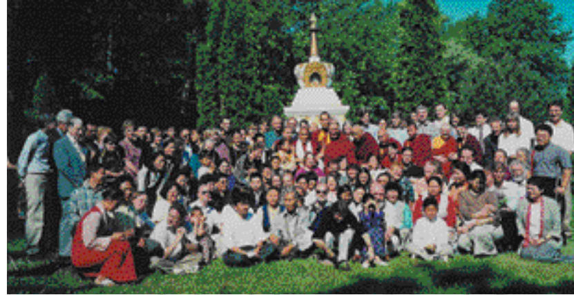
The Deer Park community with his Holiness the Dalai Lama.

Deer Park welcomes all who wish to participate. To ensure that Deer Park remains a place for people of all ages to experience the source of peace and enlightenment, please offer your support for the new temple.